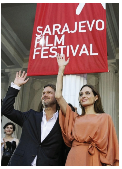
Film Festival - Brad Pitt and Angelina Jolie

Sarajevo is the capital and largest city of Bosnia and Herzegovina (and of the Federation of Bosnia and Herzegovina entity). As such, Sarajevo is the leading political, social and cultural centre, as well as historically famous for its religious diversity (Islam, Orthodoxy, Catholicism and Judaism) and therefore called "Jerusalem of the Europe". The city has developed under the Ottoman Empire (in 15<sup>th</sup> century). Sarajevo is well known all over the world as the place of the assassination of the Archduke of Austria Franz Ferdinand that caused World War I. In 1984 it hosted the 1984 Winter Olympics.