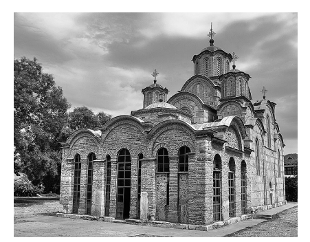
THE GRAČANICA MONASTERY

The Gračanica monastery is one of the Serbian King Milutin's last monumental endowments, a beautiful Byzantine building. In fact, it is a Serbian Orthodox monastery, located in Kosovo, built in 1321. The village of Gračanica itself is a Serb enclave nearby Priština.